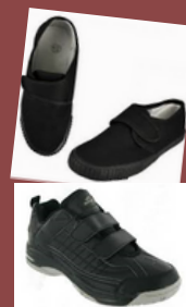
PE kit: Plimsoles or trainers