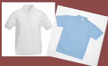
White or pale blue polo shirt