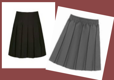
Black or grey skirt