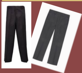
Black or grey trousers