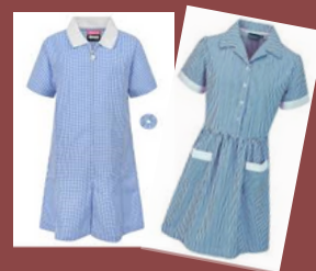
Summer: Checked or striped blue dress