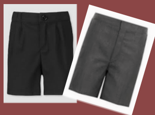
Summer: Black or grey shorts