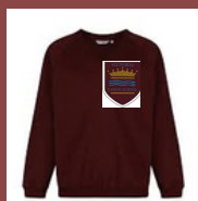
VJS maroon jumper