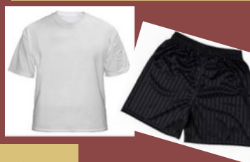
PE kit: White t-shirt & black shorts. If cold, black joggers